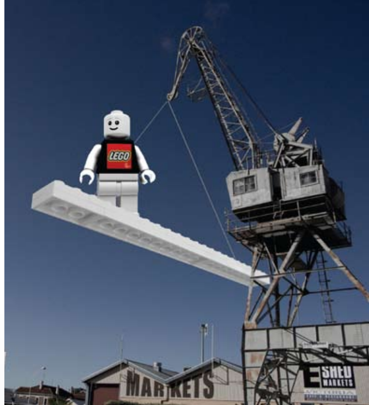
Sponsored by Fielders, ARUP, Lego, Danpalon, Dulux, Gaggenau, Gainborough & Miele.